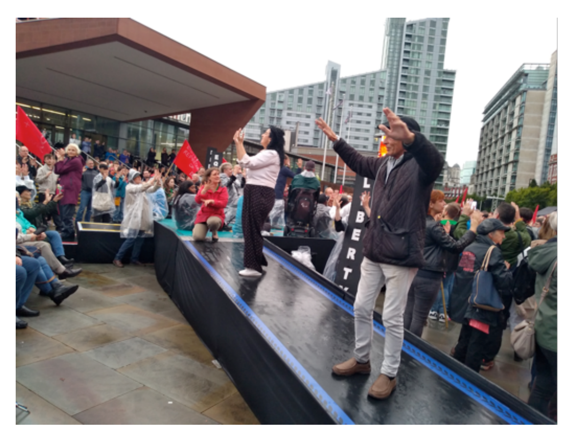
Learning how to say the words 'people' and 'power' in sign language

I had already noticed that there was a signer for deaf people on the cat walk, furiously signing about everything that was said. It was then pointed out that the rights of deaf and disabled people have often been ignored and that 20 years ago Manchester witnessed the first march in support of sign language.