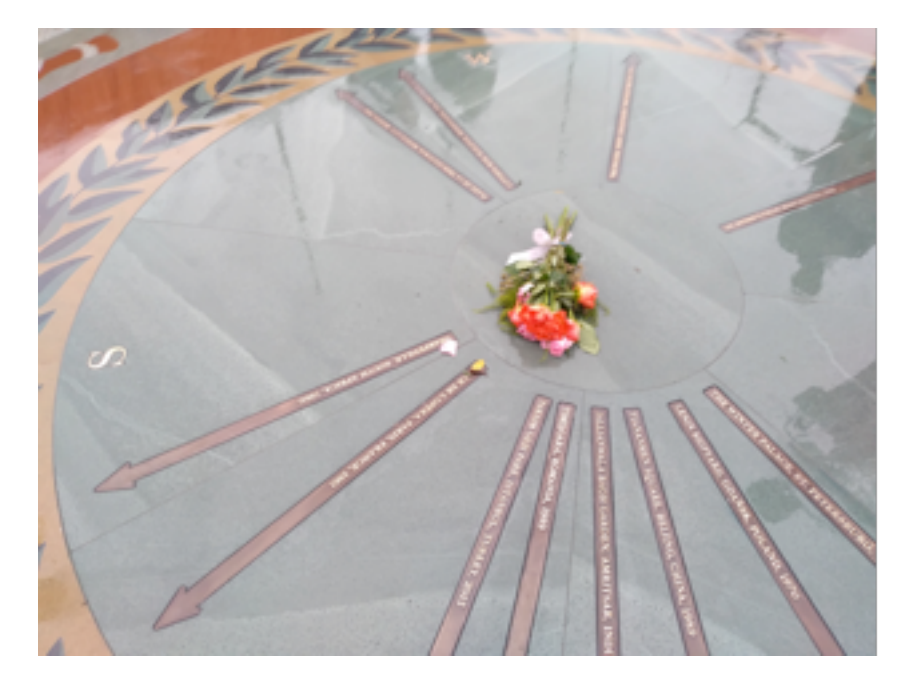
Part of the controversial memorial to Peterloo, remembering massacres at other political protests

Then the issue of the controversial Peterloo Memorial came up. As can be seen from the picture below, there is no disabled access to the top of it. To see it fully, you have to be able to walk and climb it. Consequently, the memorial was described as vile by a disabled man, who bitterly criticised Manchester City Council. We were told how they had ignored a large amount of campaigning to build it as it was, but how increasing pressure had now forced Manchester City Council to provide disabled access in the future.